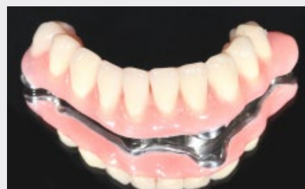
Secondary structure of an Atlantis 2in1 designed as a hybrid, finished with prefabricated teeth and denture resin.