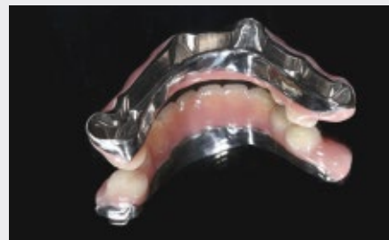
Secondary structure of an Atlantis 2in1 is designed to be attached to the primary using friction fit.