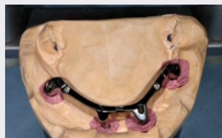
Primary structure of an Atlantis 2in1 is designed as a bar to be fixed to implants.