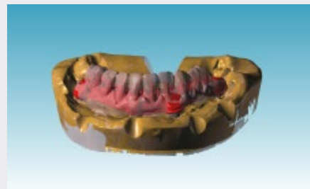
CAD design of the suprastructure in Atlantis Viewer, for approval prior to milling.